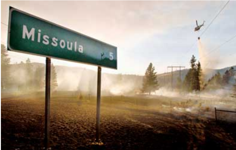
In August 2007, firefighters

battled 10 separate fires along a local access road to Interstate 90. Michael Gallacher