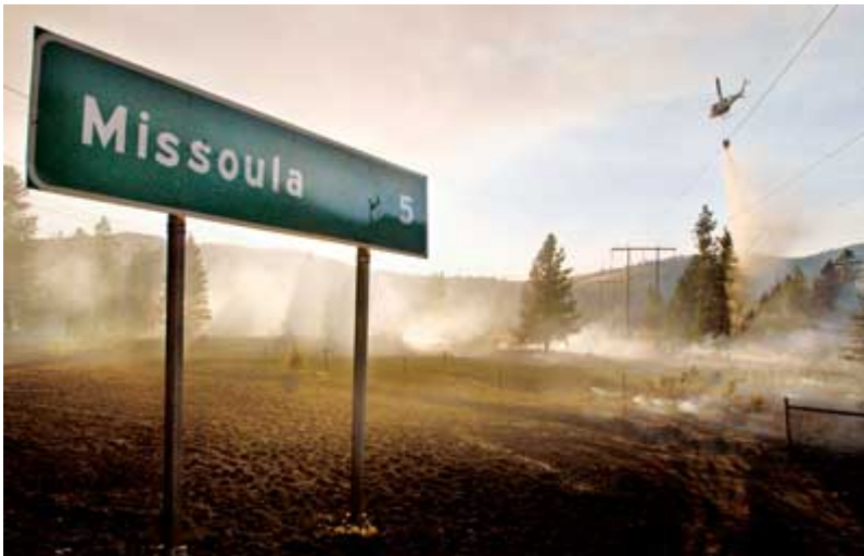
In August 2007, firefighters

ISSUE: Winter 2008 , FEATURE STORIES | December 1, 2007