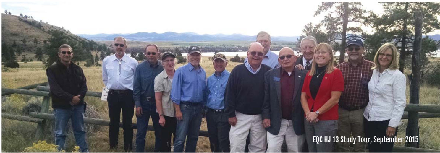
EQC HJ 13 Study Tour, September 2015