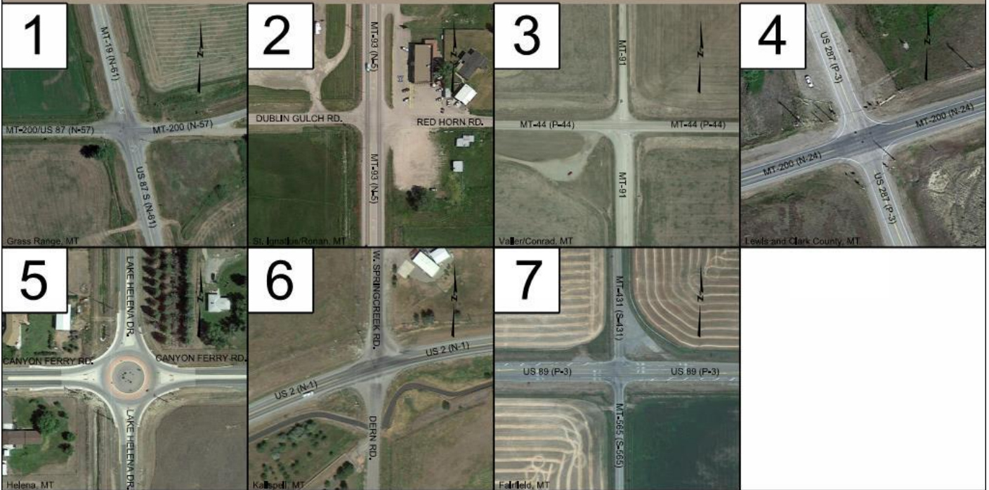
Figure 1: Montana Case Study Locations