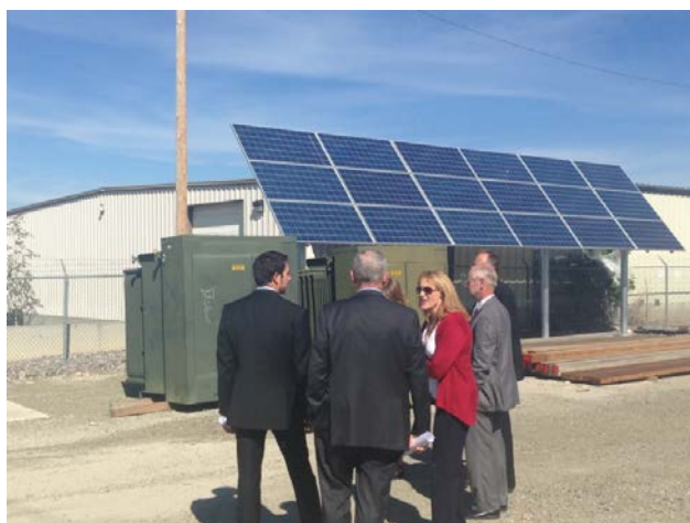
Members of the ETIC visit NorthWestern Energy's Battery Storage Project in Helena during a Sept. 2015 meeting.

Montana's net metering law was enacted in 1999. Renewable installations of less than 50 kW capacity are eligible for net metering on NWE's system. NWE has about 1,500 net-metered systems. Montana-Dakota's net metering program is governed by a Public Service Commission (PSC) approved net metering tariff that took effect in June 2008. The provisions of the tariff are similar to the provisions of Title 69, Chapter 8, part 6, in that capacity is limited to 50 kW and