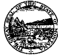
Steve Bullock Governor