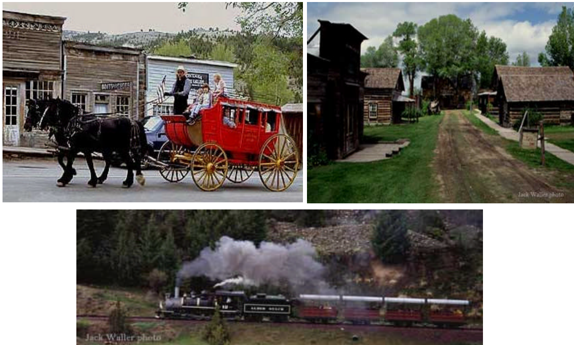
Figure 2 Visitor Attractions