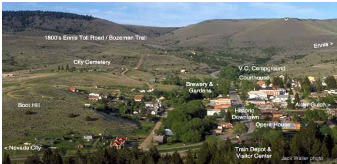
Figure 1 Virginia City Site