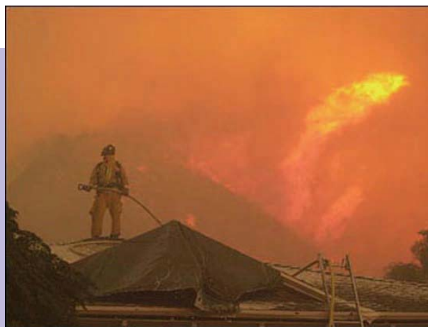
Climate change could result in an extended fire season.