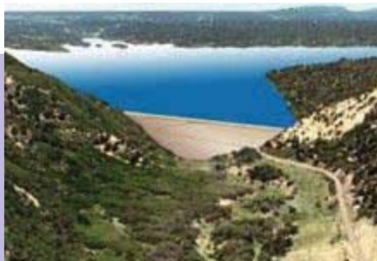
Artist’s rendition of completion of Ridges Basin Dam, being built pursuant to implementation of the Colorado Ute Settlement Act of 2000.

It has long been the accepted premise that meeting the cost of Indian water and infrastructure in Indian water rights settlements is the trust responsibility of the federal government. At the same time, it must be acknowledged that an appropriate share of these costs of settlement, which correspond to non-Indian water and infrastructure benefits, increasingly a component of Indian water rights settlements, should be borne by the states. The states and the federal government must work together to jointly design and fund settlement projects that provide the greatest benefit for Indian and non-Indian water users alike in those situa-